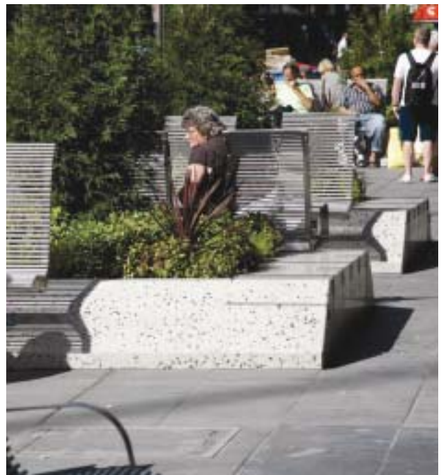
Precast concrete furniture with a honed exposed aggregate finish

The form and location of the various precast concrete elements also reinforces the functions of the activity areas within the Mall. For example, the central open space is flanked by four precast concrete tree planter surrounds. These in turn form the corners to smaller, more-intimate seating nodes, located in areas where less cross traffic occurs.