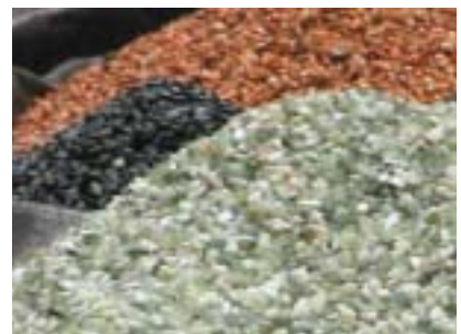
Decorative stones Tim Cole