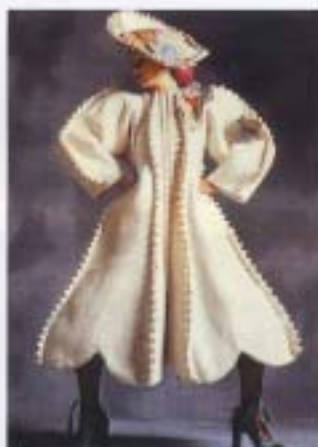
Butterfly No. 53, coat designed by Zandra Rhodes in 1971

Terrazzo is an ancient flooring material made from a conglomerate of special cements and pigments