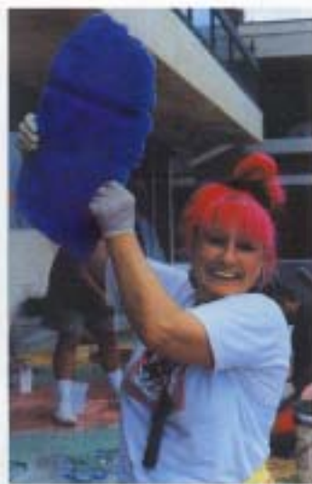
Zandra Rhodes participating in the construction of her terrazzo design

phies of both artists was electric and inspiring. The results of this whimsical collaboration are now permanently set into the expansive terrazzo patio of Rhodes' house in Del Mar, California. The beach environment and the rhythms of the sun, sea and sand are reflected in the design, which bears a flowing blue squiggle pattern of water over a base of sandy yellow and pink, inset with decorative elements of shells, marble mosaic, terrazzo shards and sparkling mirror. The artists Zandra Rhodes and David Humphries have applied the magic of terrazzo in a unique way. Thousands of local beachgoers observed the creation of the terrace over the 10 days of production and responded with a mixture of curiosity and delight at the brilliance of the final result – a tri-