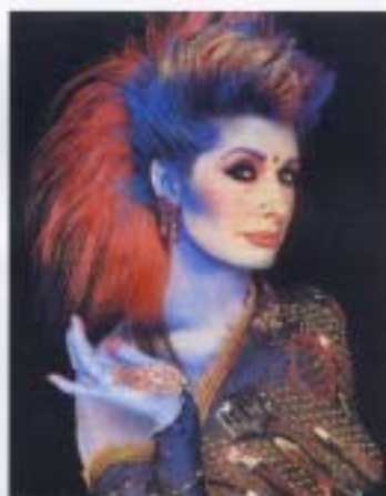
Photograph of Zandra Rhodes taken in 1982 for use on 'Indian' poster